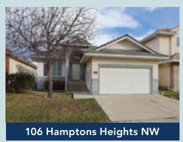
4 Bdrms, Walkout on Golf Course $1,149,900

3D tours, detailed floor plans, plus much more with our proven marketing and state-of-the-art technology. Call for your <u>free home evaluation</u> today!