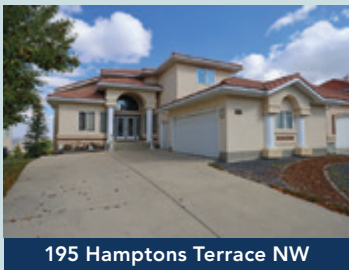
5 Bdrms, Walkout on Golf Course $1,250,000