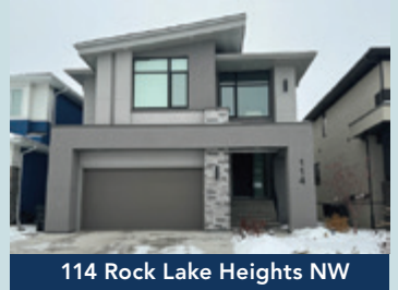
Fully Loaded, Backs on Reserve $1,629,900

Sell your home quickly for asking price, possibly above!!