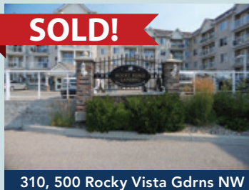
Updated 2 Bdrms / 2 Bath, 3rd Flr $339,900