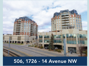
Renaissance, 2 Bdrms, City Views $569,900