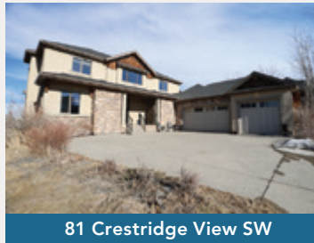
81 Crestridge View SW 6 Bdrms + Den, Finished Walkout $1,598,900