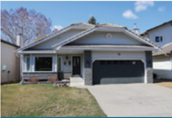
75 Scenic Glen Crescent NW 5 Bdrms, Walkout on Ravine $829,900

Contact Us Today and Let Our Experience Work for You!