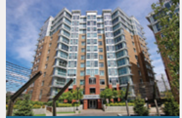
302, 16 Varsity Estates Cir NW 2 Bdrms + Sunroom, Corner Unit $499,900