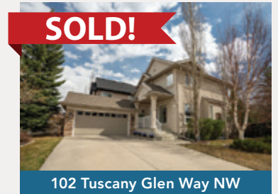
102 Tuscany Glen Way NW 5 Bdrms + Den, Fully Finished $949,900

3D tours, detailed floor plans, plus much more with our proven marketing and state-of-the-art technology. Call for your free home evaluation today!