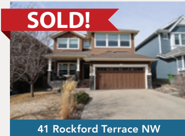
41 Rockford Terrace NW 4 Bdrms + Den, Fully Finished $999,900