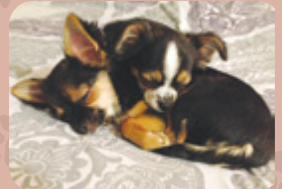
Tiger and Lily, Evanston

To have your pet featured, email news@mycalgary.com