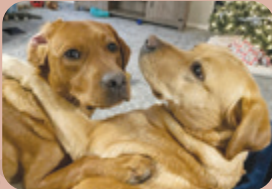
Lake and London, Cranston