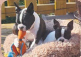
Thor and Loki, Shawnessy