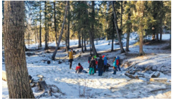
Outdoor learning at Camp Cadicasu...

Drop your bottles off at the TCA community centre. Scouts will be on hand to help unload and get rid of used bottles.