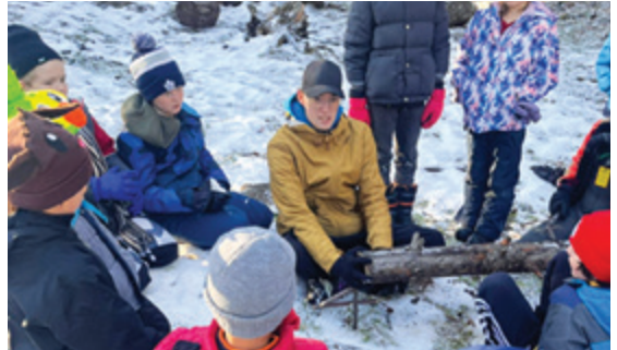
...and plenty of fun!