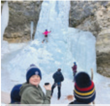
Cubs Snow Shoe Adventure to Troll Falls