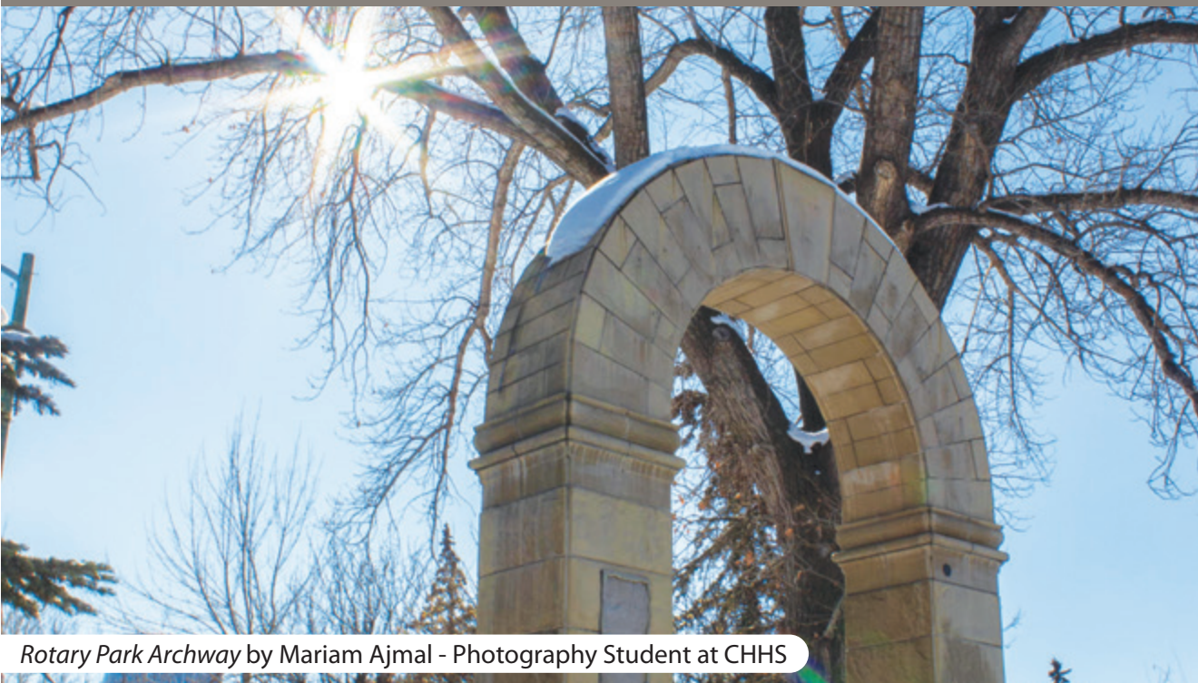
Rotary Park Archway by Mariam Ajmal - Photography Student at CHHS

THE OFFICIAL CRESCENT HEIGHTS COMMUNITY NEWSLETTER