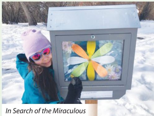
In Search of the Miraculous