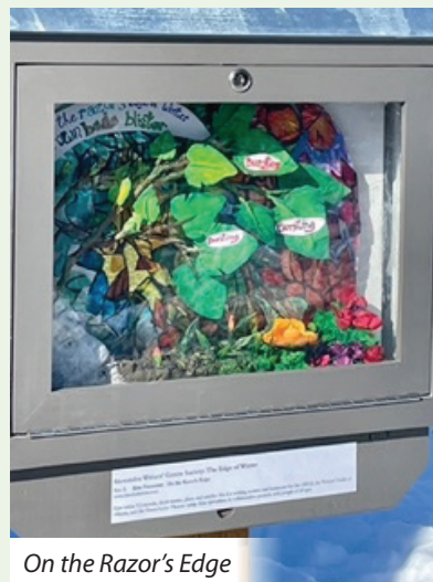
On the Razor's Edge