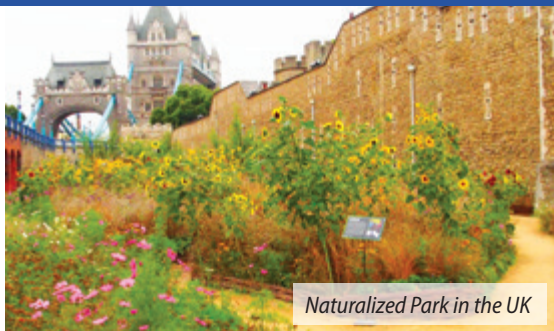
Naturalized Park in the UK

First of all, here is a quick reminder that our first Landscaping Information Session will be on March 22, 2023, at the Edgemont Community Centre from 7:00 to 9:00 pm. Please bring your questions with you, or even better, submit them beforehand to askElm@edgemont.ab.ca to give our ELM coordinator time to provide you with the most comprehensive information possible! Remember that gardening in Edgemont is a very different beast!