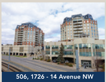
2 Bdrm Renaissance Condo, Views $569,900