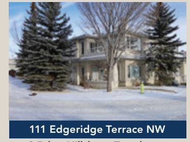
2 Bdrm Hillsboro Townhome $419,900

3D tours, detailed floor plans, plus much more with our proven marketing and state-of-the-art technology. Call for your <u>free home evaluation</u> today!