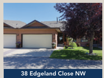
Renovated Villa on Ridge $699,900