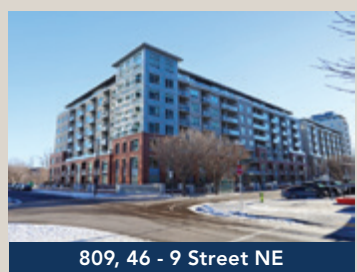
Top Floor, 2 Bdrm, Bridgeland $579.900