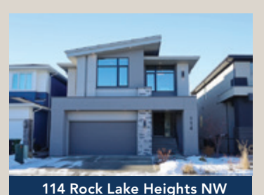
6 Bdrms + Den, 3 Car Garage $1,629,900