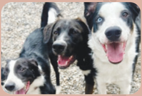
Bowser, Remus, Riku, Montgomery