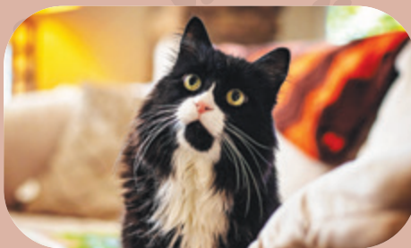
Tuxedo Joe, Cranston

To have your pet featured, email news@mycalgary.com