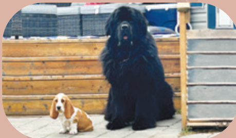
Baloo and Walter, Springbank Hill