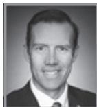
MP John Barlow, Foothills 109 - 4 Avenue South West (Main Office) High River, Alberta T1V 1M5 403-603-3665 John.Barlow@parl.gc.ca