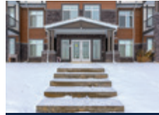
311, 6603 New Brighton Avenue