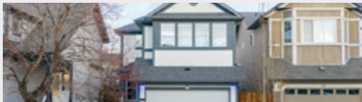
46 AUTUMN CIRCLE SE ~ $780,000

Original owners in this immaculate home! Great location on a quiet street and still looks like a new home! There is a main floor office space on the main floor, a cozy living room with a fireplace, a generous sized eating area, and a kitchen that you will love! There are also 3 great sized bedrooms upstairs, upper laundry room, and a sunny and bright bonus room to enjoy. The current upgrades include carpet, fridge, dishwasher, new sinks in the bathrooms, and an updated hot water tank! Ready for you to move in and enjoy!