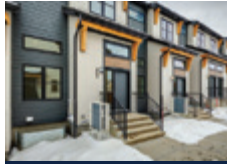
402, 135 Mahogany Parade