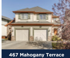
467 Mahogany Terrace