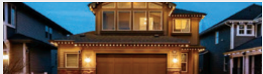
128 AUBURN BAY AVE SE ~ $920,000

Amazing location! This 4 bedroom/4 bathroom home has just under 3000 sq. ft. of total developed space in a prime location in Auburn Bay! Tile flooring runs through the main floor and there is a cool office/desk space right off the kitchen, a gas fireplace in the living room, and an upgraded kitchen to enjoy! Upstairs there is a bonus room with 7 windows and partial mountain views, 3 bedrooms and upper laundry room! The upgrades include: stove & dishwasher (2024), central A/C (2023), microwave (2023), paint, sink, counters and faucet in the kitchen (2023), feature wall & mantle (2023), paint on baseboards and trim (2023), shingles (2022), water tank (2021), washer & dryer (2019) AND furnace maintenance in 2024 and dryer vent maintenance in 2025!