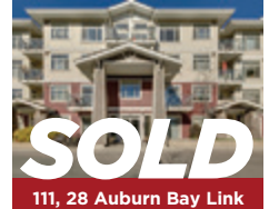
111, 28 Auburn Bay Link