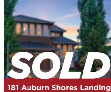
181 Auburn Shores Landing