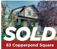
83 Copperpond Square