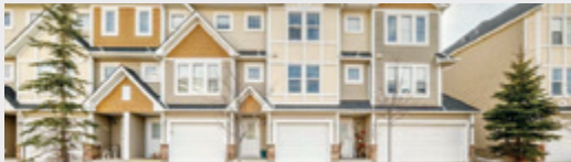
307 AUBURN BAY CIRCLE SE ~ $475,000

If you are looking for real estate help, call me! Since 1998, I have helped over 1,200 families achieve their real estate dreams. Over 180 homes sold in Auburn Bay, thank you!