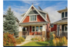
123 Marquis Green