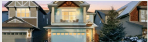
185 AUBURN GLEN CIRCLE SE ~ $765,000

Welcome to this amazing townhouse located just a quick walk to the lake and all of the areas amazing amenities! This one features a rare yard & basement space that can be used as a bedroom or an office or a great place for the kids to hang out in (even has a 3-pc. bathroom down there) The main living areas are awesome with soaring vaulted ceilings in the living room with access out to the back yard, the kitchen features quartz countertops and then as you make your way up the bedrooms you will love the dual primary that both have ensuite and walk in closets! There is also A/C, an attached garage, and low condo fees!