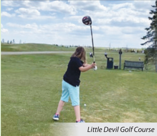
Little Devil Golf Course