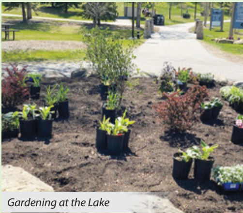
Gardening at the Lake

Disclaimer: The opinions expressed within any published article, report, or submission reflect those of the author and should not be considered to reflect those of Great News Media or the Community and/or Residents' Association. The information contained in this newsletter is believed to be accurate but is not warranted to be so.