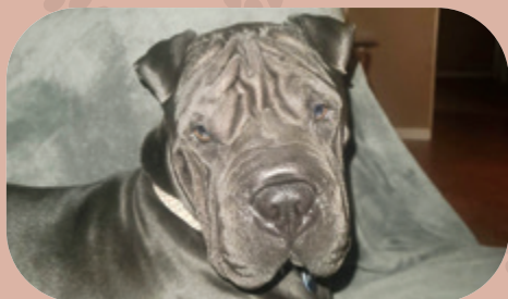
Rigby, Huntington Hills