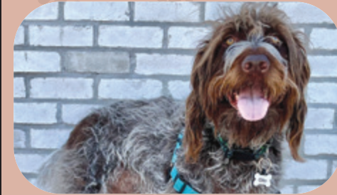
Otto, Crescent Heights