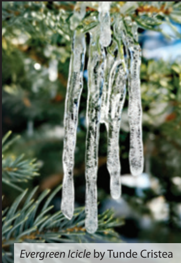
Evergreen Icicle by Tunde Cristea