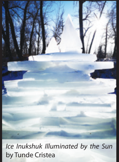
Ice Inukshuk Illuminated by the Sun by Tunde Cristea