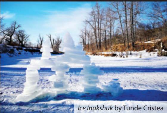
Ice Inukshuk by Tunde Cristea