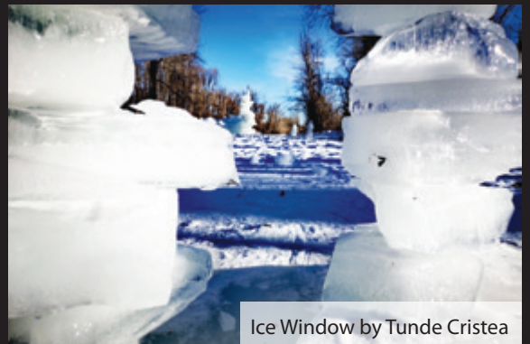
Ice Window by Tunde Cristea