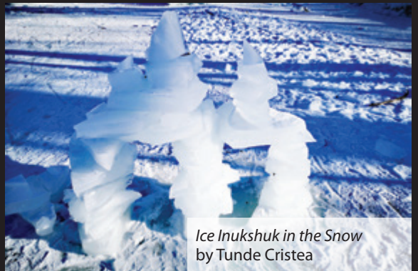
Ice Inukshuk in the Snow by Tunde Cristea