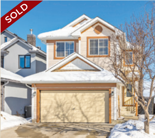
RIVER ROCK COURT

*Not intended to solicit properties currently listed for sale.