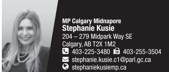
MP Calgary Midnapore Stephanie Kusie

204 – 279 Midpark Way SE Calgary, AB T2X 1M2