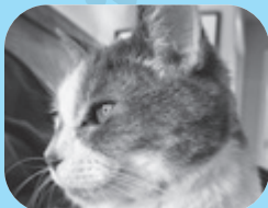
Squeeks, Mount Pleasant