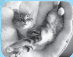
Ravioli, Lower Mount Royal