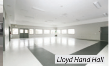
Lloyd Hand Hall