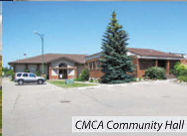
CMCA Community Hall