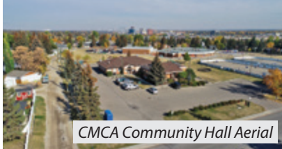
CMCA Community Hall Aerial