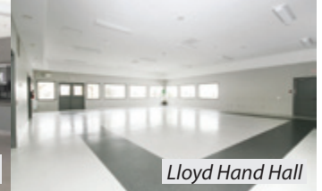
Lloyd Hand Hall