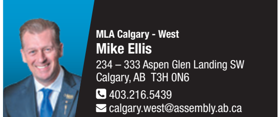
MLA Calgary - West