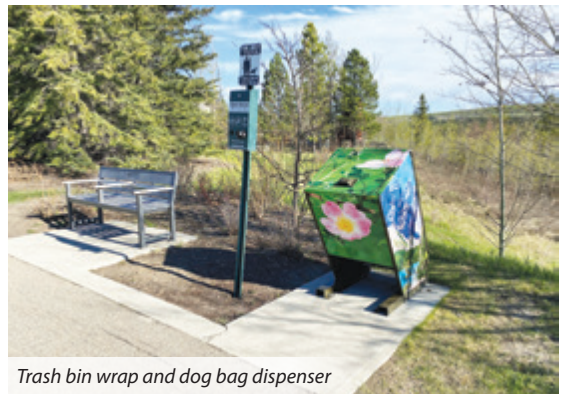
Trash bin wrap and dog bag dispenser

We are always happy to hear from our NDHA members; please access our website at www.ndha.ca for NDHA news updates or to send an email. You can also call us at 403-237-9595.