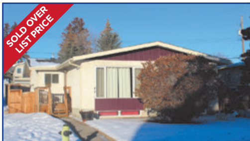
47 & 49 Galbraith Drive

Our local real estate market has been very active so far in 2023. With inventory levels low, homes that are priced right, presented, and promoted well are selling quickly at superior prices.