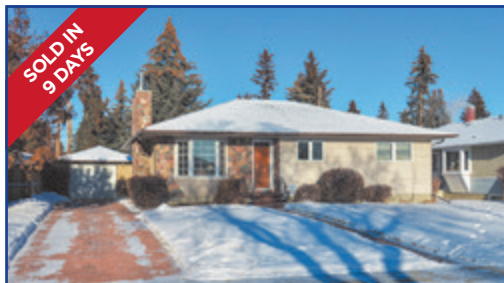
4260 Gloucester Drive