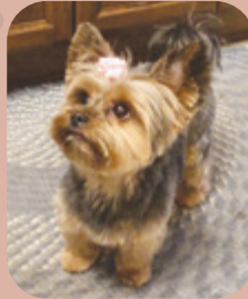
Baby, Mount Pleasant