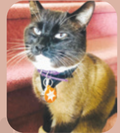
Boots, Richmond Hill