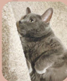
Smokey, Tuxedo Park