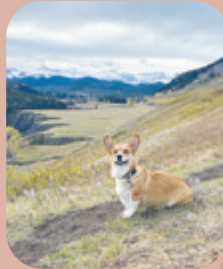
Belle, Lake Bonavista