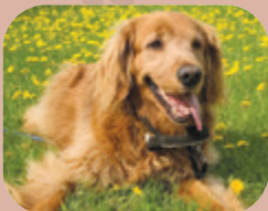
Chile Mango Bean, Sundance