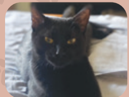
Stormi, Deer Ridge

To have your pet featured, email news@mycalgary.com