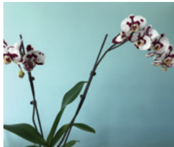
The yellow lady slipper My own Harlequin Phalaenopsis! A beauty that flowers often and is very easy to care for.