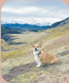
Belle, Lake Bonavista