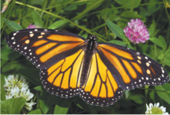
Female Monarch in May

In mid to late March, something extraordinary happens in Mexico. Monarch butterflies ( Danaus Plexippus ) migrate north after sheltering in the Oyamel fir tree forests (the eastern perimeter of the Mexican state of Michoacán) to start their breeding season, an eight-month multi-generational migration of four successive generations to the prairie provinces and Eastern Canada then back. A typical monarch life span is two to six weeks, but the final leg of migrating monarchs can live up to nine months flying south. The Western population, call B.C. home, and winter in California. Our monarchs, the Eastern population flies to Central America, which can be 2,500 to 3,000 miles. Not all monarchs migrate! These beautiful, large butterflies with orange, black and white colouration are distinct and have become a flagship of conservation. By the way, a group of butterflies is officially called a kaleidoscope. Groups of caterpillars are called an army.