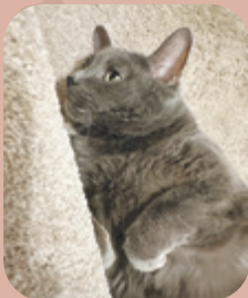
Smokey, Tuxedo Park