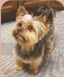
Baby, Mount Pleasant