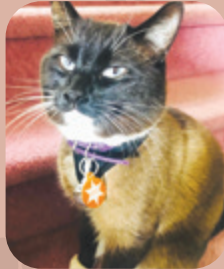
Boots, Richmond Hill