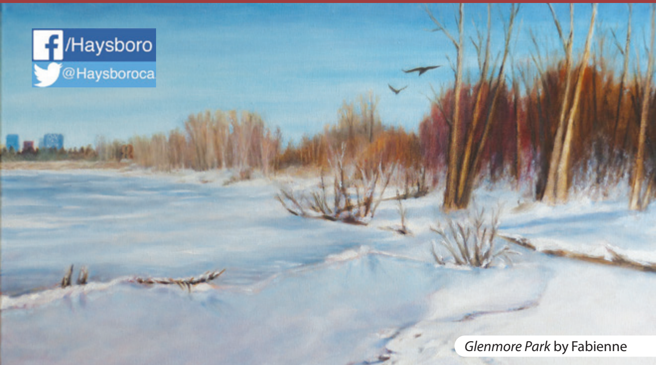
Glenmore Park by Fabienne