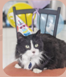
Sir Pepè, Somerset

To have your pet featured, email news@mycalgary.com