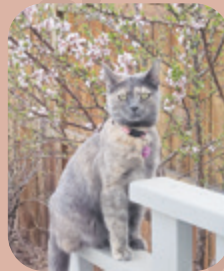
Nola, Mount Pleasant