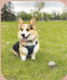
Moony, Lake Bonavista