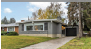
Fantastic Family Home