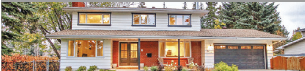
Luxury Family Home

3148 Linden Drive SW - Lakeview - $1,825,000 - MLS# A2087629