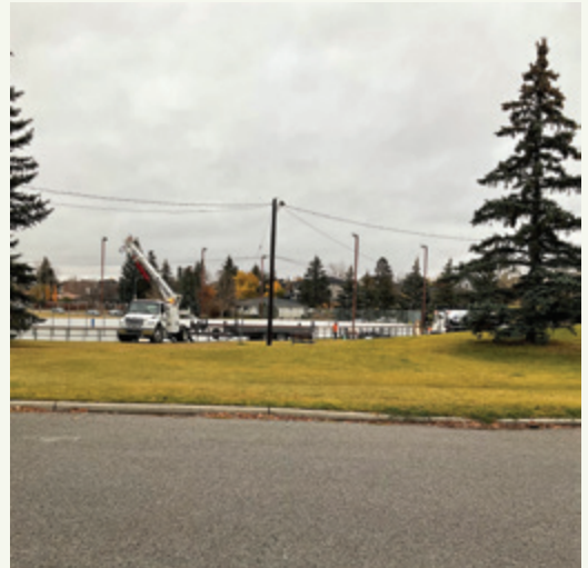
Let There Be Lights