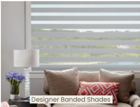
Designer Banded Shades

825-258-5595 hello@L2interiors.ca www.L2interiors.ca