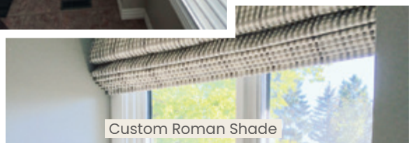
Custom Roman Shade