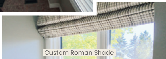
Custom Roman Shade