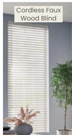
Cordless Faux Wood Blind