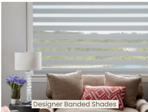
Designer Banded Shades