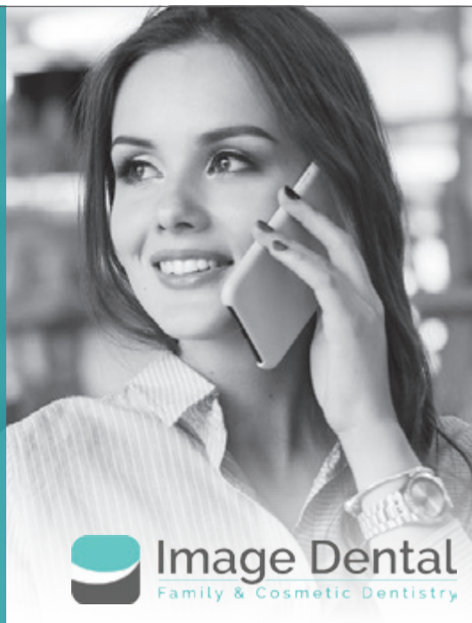
Image Dental Family & Cosmetic Dentistry

Services are provided by general dentists