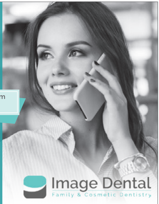
Image Dental Family & Cosmetic Dentistry