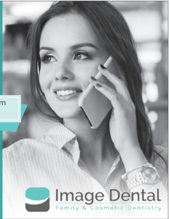
Image Dental Family & Cosmetic Dentistry