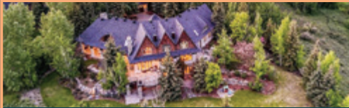
268 Snowberry Circle

67 transactions and 66 million sold in 2023