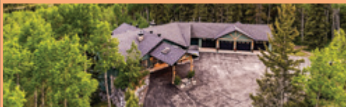
309 Wild Rose Close

5 Bed, 5.5 Bath | Mountain Vistas | 6,300 sqft