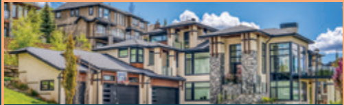
44 Spring Valley Lane SW

5 Bed, 5.5 Bath | Guest Suite | Breathtaking Views