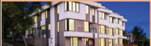
2301 13 Street NW

3 Bed, 4.5 Bath | Bragg Creek Retreat | 11 Acres