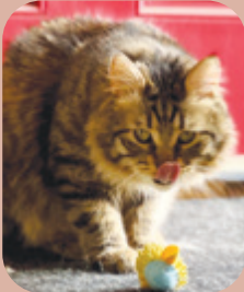
Dobby, Huntersen Place