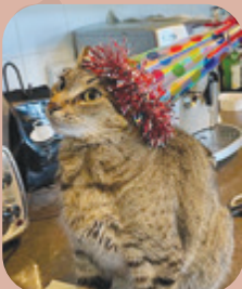
Sugar, Signal Hill