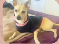
Sparky, Douglas Glen

To have your pet featured, email news@mycalgary.com