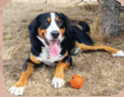
Moose, Canyon Meadows