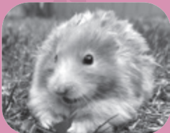
Biscuit, Deer Run