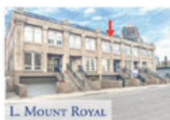
L. MOUNT ROYAL