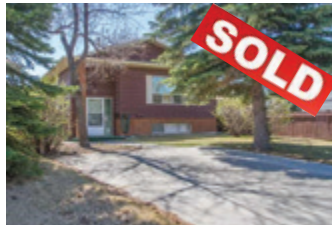
32 FONDA DRIVE SE $499,900