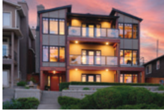
954 DRURY AVENUE NE $1,899,900