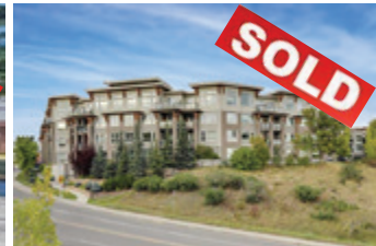
#132, 721 4 STREET NE $479,900