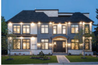
4308 CORONATION DRIVE SW $4,350,000