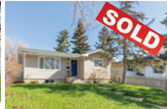
69 DOVERCLIFFE CLOSE SE $549,900