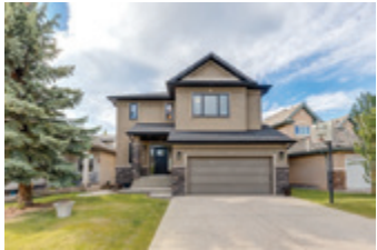
141 EVERGREEN WAY SW $1,350,000