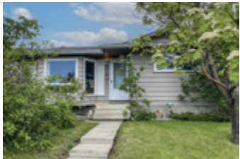
3532 33 STREET SE $529,900