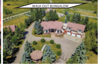
WALK-OUT BUNGALOW 8070 266 AVENUE W $1,800,000