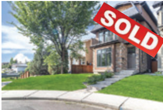
1106 COLGROVE AVENUE NE $975,000