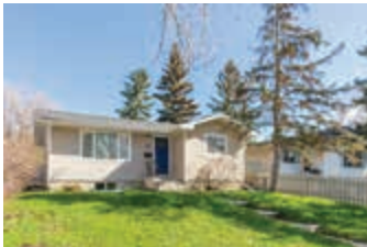
69 DOVERCLIFFE CLOSE $549,900