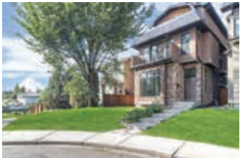
1106 COLGROVE AVENUE $975,000