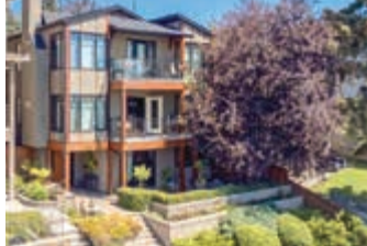
954 DRURY AVENUE $1,899,900