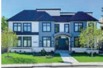
4308 CORONATION DRIVE $4,350,000