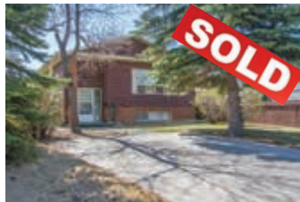
32 FONDA DRIVE $499,900