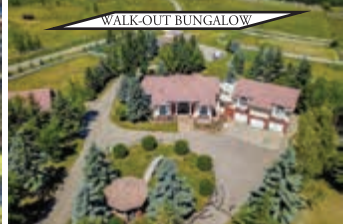
8070 266 AVENUE W $1,800,000