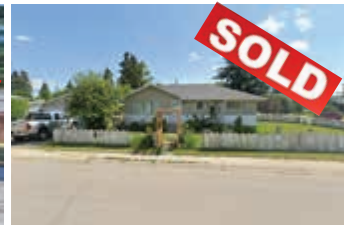
802 47 STREET SE $449,900