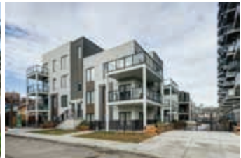
#207, 455 1 AVENUE NW $334,900