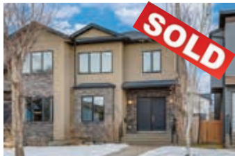
1207 RENFREW DRIVE $824,900