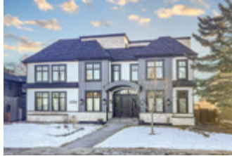
4308 CORONATION DRIVE $4,500,000