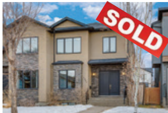
1207 RENFREW DRIVE $824,900