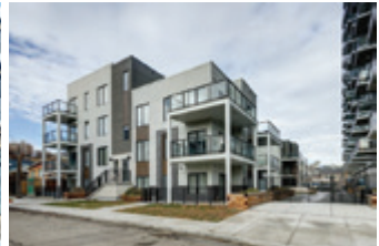
#207, 455 1 AVENUE $334,900