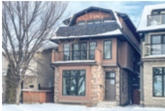
1106 COLGROVE AVENUE $988,888