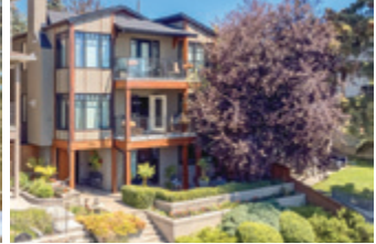
954 DRURY AVENUE $1,899,900