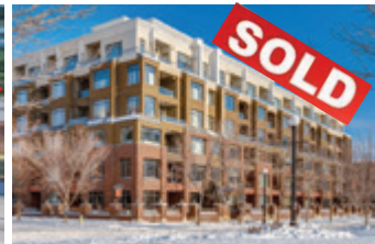
#227, 950 CENTRE AVENUE $299,900