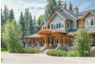
103 MOUNTAIN RIVER ESTATES $4,200,000