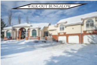
8070 266 AVENUE W $1,800,000