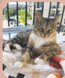
Willow, McKenzie Towne

To have your pet featured, email news@mycalgary.com