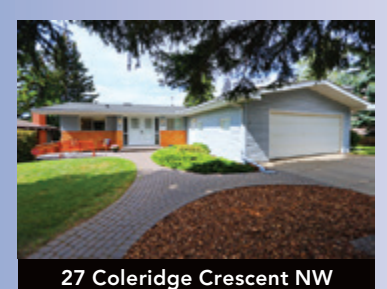
6 Bdrms, Fully Finished, West Yard $899,900

Sell your home quickly for asking price, possibly above!!