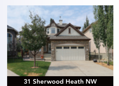
4 Bdrms + Den, A/C, Fully Finished $899,999

3D tours, detailed floor plans, plus much more with our proven marketing and state-of-the-art technology. Call for your <u>free home evaluation</u> today!