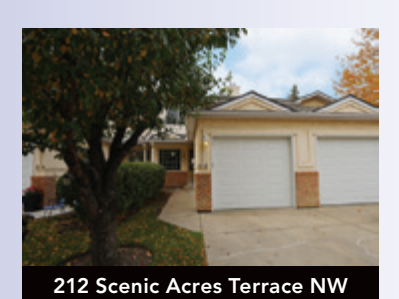
Updated 2 Bdrms, Finished Walkout $549,900