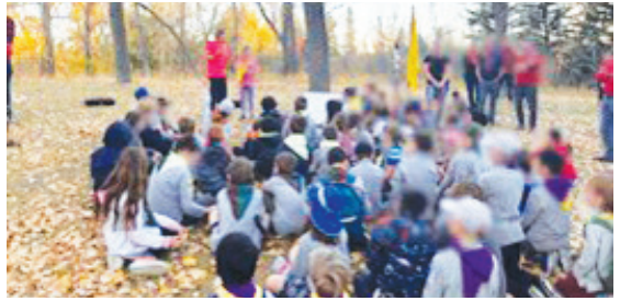
Cubs playing animal game