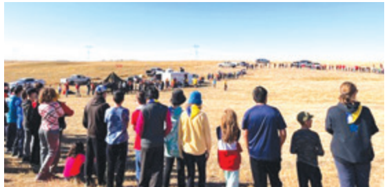
Scouts gathering after the Great Escape