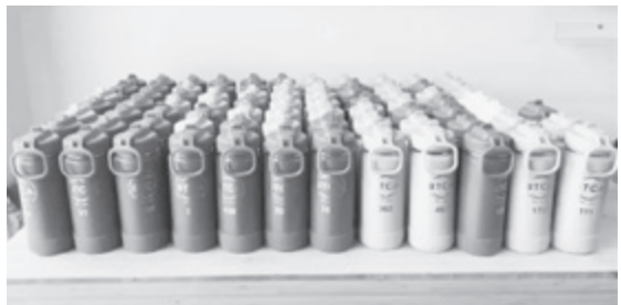
Engraved Water Bottles by Kendall Creations YYC