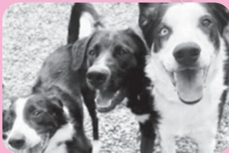
Bowser, Remus, Riku, Montgomery