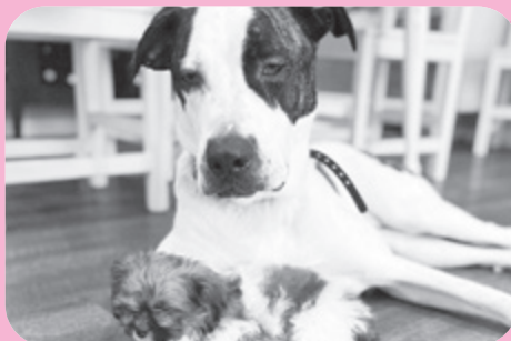
Teddy and Sassy, Foothills