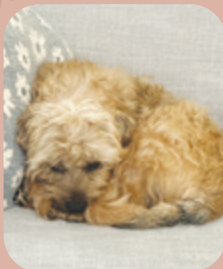
Rollie, Auburn Bay