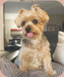
Lulu, Signal Hill