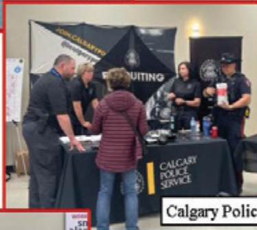
Calgary Police Dept.