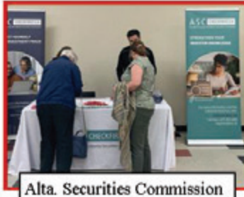
Alta. Securities Commission