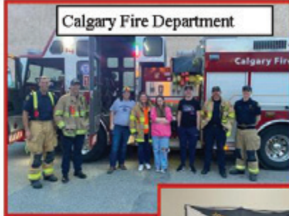
Calgary Fire Department