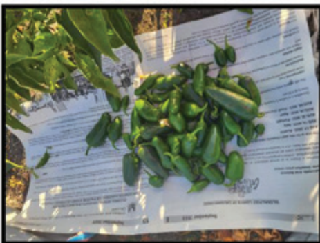
Peppers harvested from one of our community plots.

Learn more about our projects: beddingtoncommunity.ca/reimagine